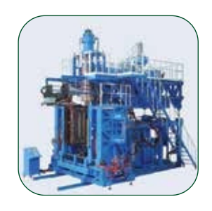
New Genera non Technology