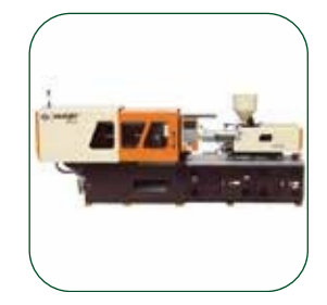
German Technology Machine