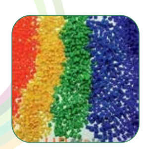
Virgin Quality Material

The offered range covers: Indoor Pots II Outdoor Pots Hanging Baskets II Railing Pots II Expandable & Foldable Pots II Window Planters and Vase.